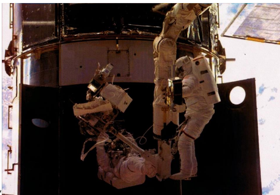
Exhibit 1 Orbital Envoys of Humankind

Our embryonic envoys have been essential intelligence agents for greater understanding of this survival vision—a total view. Through our efforts to propagate our envoys into the cosmos, through their own personal preparation and adjustments, and also through our remote biotechnological reception of their new transglobal outlook, our envoys have helped us begin to understand the systematic, dynamic, multidimensional, and continuous nature of the cosmos.[5]