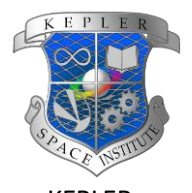
KEPLER SPACE INSTITUTE