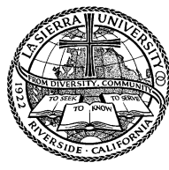
LA SIERRA UNIVERSITY