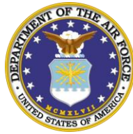
UNITED STATES AIR FORCE