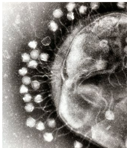
Figure 2. Illustration of a virus invading a cell.

At the level of the virus, and indeed the cells and the DNA and the RNA, we are at a key interface between classical mechanical mechanism and interaction, the quantum world and the living world. In the quantum world the no-cloning theorem forbids the duplication of quantum states. In the world of DNA, replication is the key. In the simplest world of RD, replication is the first action of the system (see the first lines of Section I herein). Mechanism and recursion arise together in the context of distinction. How do these mechanisms arise in the nexus of quanta, classica and life?